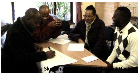
Ntapo responding to a group assignment.

This kind of pooling of resources and working together with mutual respect across cultural and racial barriers appears to be what is needed in communities in South Africa, where apartheid, though legally abolished, still pervades many peoples’ thinking and actions in many ways.